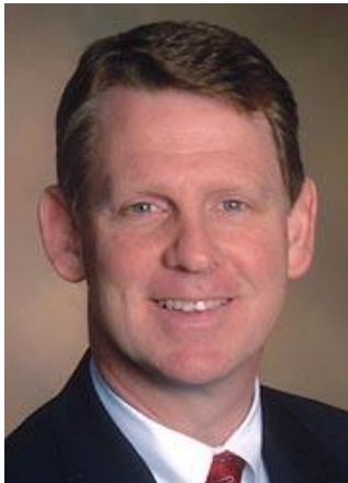
Sen. Allan H Kittleman

This Carroll & Howard County Senator achieved the highest MBRG Cumulative score (95) among all Republican veterans in the Senate. (Minimum 4 years service)